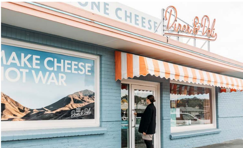
YOUR FESTIVAL REFUEL: STOP FOR COFFEE, STAY FOR THE CHEESE Whitestone Cheese Diner & Deli | 469 Thames Highway (SH1), Oamaru | whitestonecheese.com